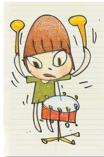
Pictured left: Banging the Drum

“Yoshitomo Nara: I Forgot Their Names and Often Can’t Remember Their Faces but Remember Their Voices Well,” at the Dallas Contemporary; March 20 - August 22, 2021. For details, visit dallascontemporary.org .